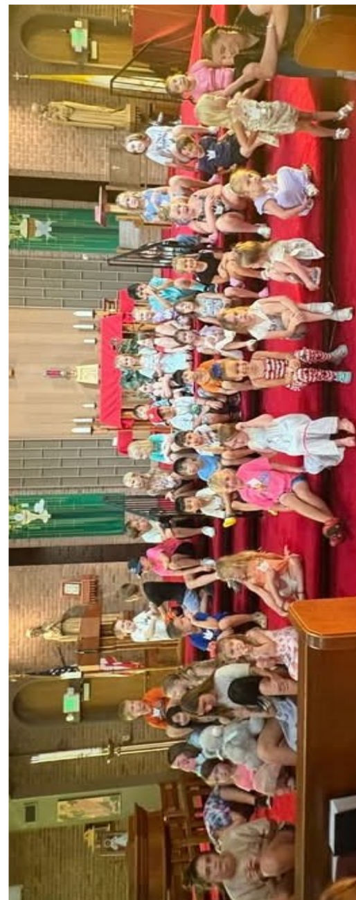
Vacation Bible School 2025