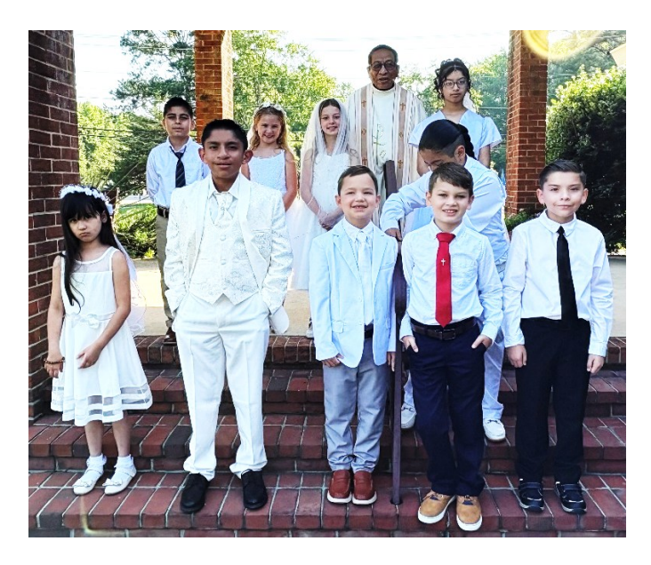
Congratulations on your reception of this most blessed and holy sacrament and pray it will sustain you forever!