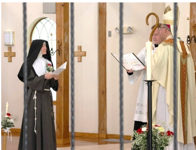
Profession of Vows