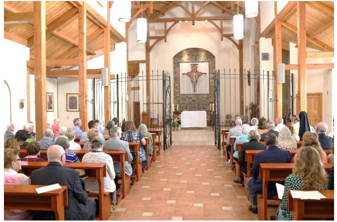
Family and attendees in the public portion of the chapel.