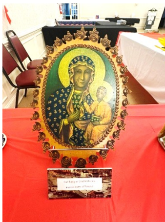
Our Lady of Czestochowa picture at Polish table.