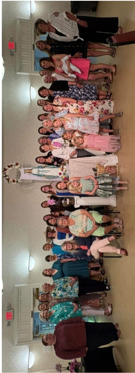
Great to see such a large crowd of all ages attended the Tea with the Blessed Mother