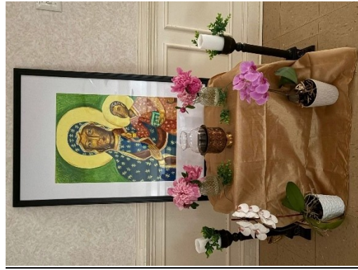
Our Lady of Czestochowa

We are all looking forward to next year's tea, honoring Our Lady of Guadalupe on May 9 th ! Mark your calendar now, you don't want to miss it!